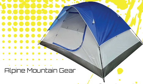
Alpine Mountain Gear

Buy a 5 Person Outback Alpine Mountain Gear Tent and get a